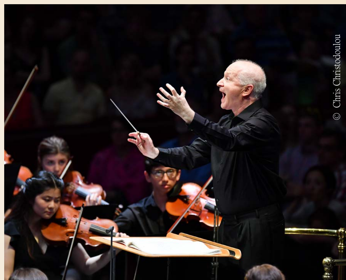
George Benjamin, conductor & composer