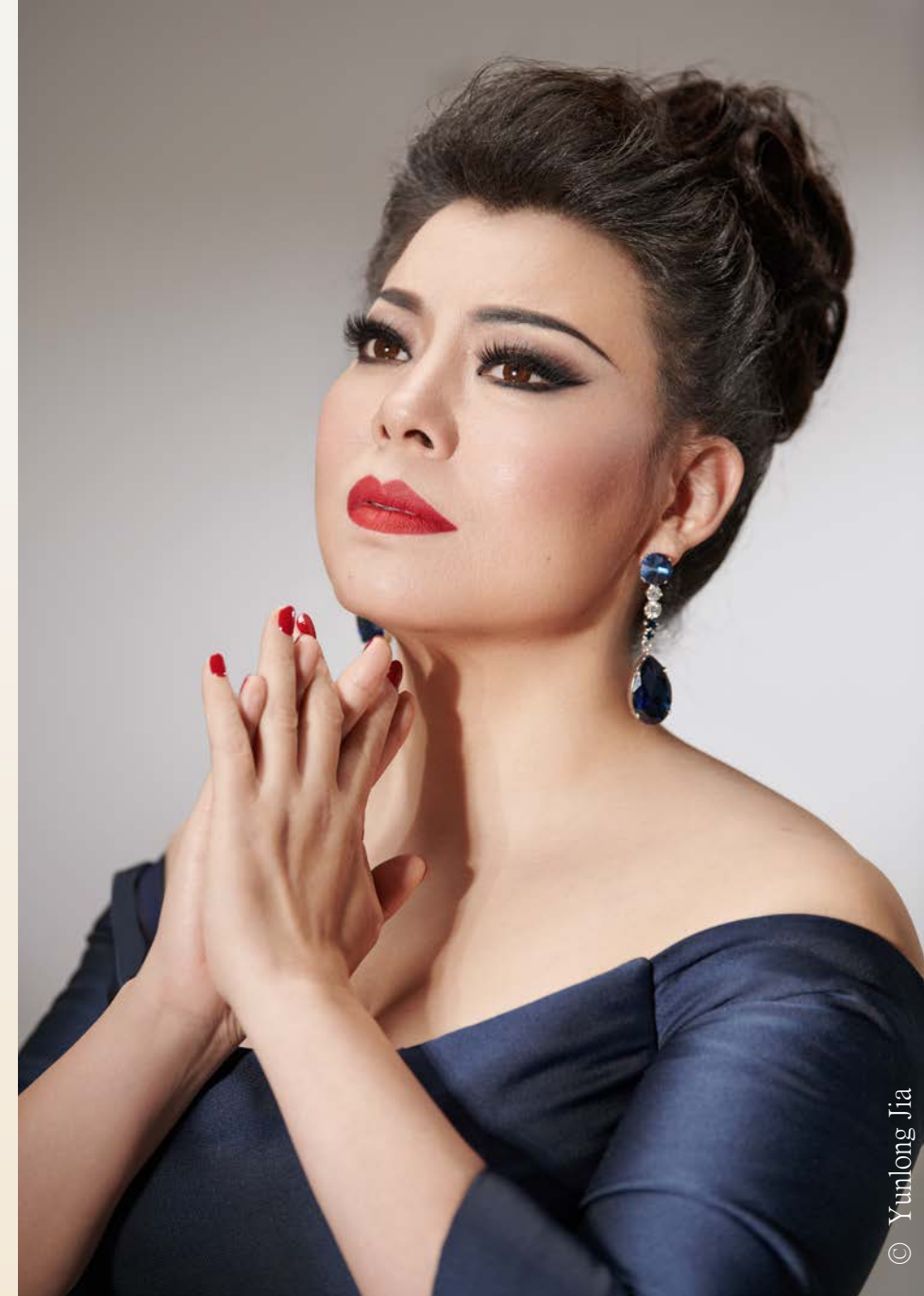
He Hui, soprano