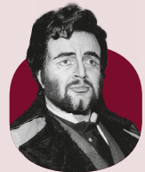
Siegmund Nimsgern 尼士基恩