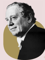
Charles Mackerras 麥嘉理斯