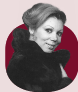
Mirella Freni 費蘭妮