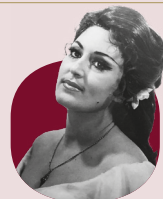
Anna Tomowa-Sintow 杜慕華—仙桃