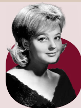
Lucia Popp 樸比