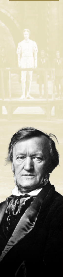
Wagner 華格納 © Hanfstaengl