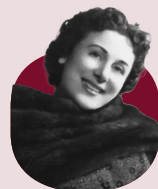
Antonietta Stella 史德拿